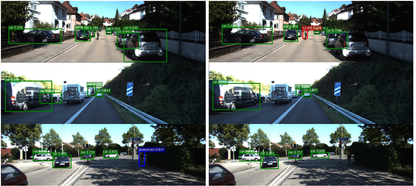
Fig. 3. Sample detections of DarkNet-YOLO on KITTI dataset (Left: FP, Right: KT).