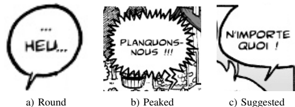
Fig. 1. Example of speech balloons. Image credits [4].

cases, including when contours are implicit, the location of text is generally a good clue to guess where the balloon is. The problem of speech balloon outline detection can therefore be posed as the fitting of a closed contour around text areas, with the distinctiveness that the outline might not be explicitly defined in the image. For the examples given in figure 1, this would be a smooth contour with relatively constant curvature (fig. 1a), an irregular one with high local curvature (fig. 1b), and an implicit one with missing parts (fig. 1c).