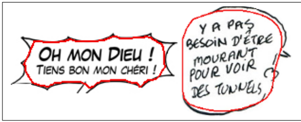
Fig. 4. Example of low resolution contour detection (red line) for closed (left) and open (right) balloons.

the snake by adding new points between the current ones and by changing the weighting parameters of the energy function, and go through a second fitting process. At this stage, we relax the E_{curv} energy to make the snake fit to coarser parts of the boundary and we set E_{cont} strong enough to keep a regular inter-point distance all over the contour. Also, we reduce the E_{text} energy weight because at this step, the snake is already far from text and this term is not informative any more. This new configuration allows the snake to detect more coarse elements as shown in figure 5.