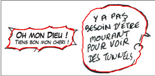
Fig. 5. Example of high resolution contour detection (red line) for closed (left) and open (right) balloons.

the snake by adding new points between the current ones and by changing the weighting parameters of the energy function, and go through a second fitting process. At this stage, we relax the E_{curv} energy to make the snake fit to coarser parts of the boundary and we set E_{cont} strong enough to keep a regular inter-point distance all over the contour. Also, we reduce the E_{text} energy weight because at this step, the snake is already far from text and this term is not informative any more. This new configuration allows the snake to detect more coarse elements as shown in figure 5.