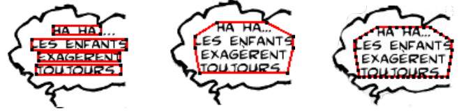
a) Group of text lines b) Text area convex hull c) Snake initialization

The initial number of points impacts the way that the snake moves and the precision of the final detection. During the first low resolution localization step, we perform a spaced equipartition of the points (see fig. 3c) to quickly localize the global shape avoiding unnecessary stops on image details. In the subsequent high resolution fitting stage, we add more intermediate points to fit the exact shape more precisely.