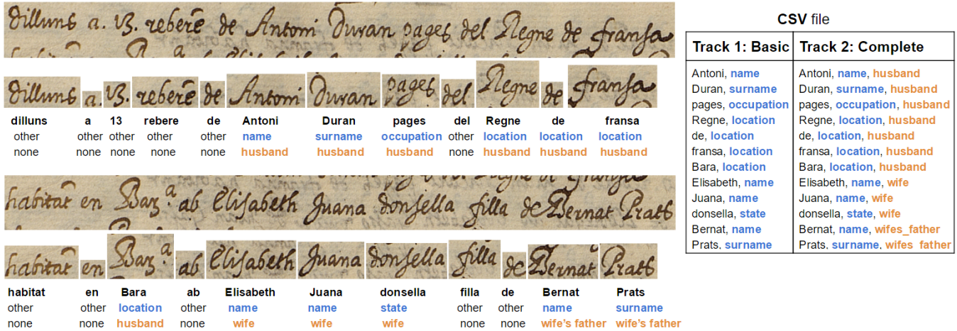
Figure 2. Example of the Ground-truth provided for a marriage record.

the end of each word. We compute the statistics of the bi-gram combination of all the characters on the training set. Since the numbers are not combined with the letters, we selected 2560 bi-gram combinations from 60 characters (59 primitives and 1 terminator) as the training classes. Next, we take into consideration the spatial location of the bi-gram inside the word, select 14 positions and convert each position to a multi-dimensional random vector. The random vector of the position information is only generated once.