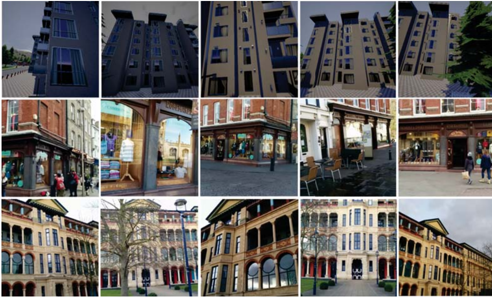
Figure 4: (1st row) Images from the synthetic image data set generated by the CARLA simulator (they were captured at different weather and lighting conditions). (2nd and 3rd row) Real-world images, ShopFacade and OldHospital of Cambridge data set respectively, used to evaluate the trained model.