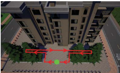
Figure 3: Trajectory followed by the camera in CARLA Simulator.

The cameras were attached to moving platform to allow navigation through the virtual-world. Fifteen different types of weathers are used to generate the set of pairs of images. All selected weather and their respective parameter settings are shown in Table 1.