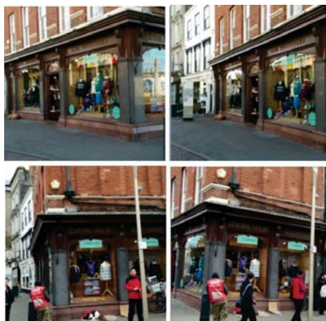
Figure 5: Challenging scenarios, pairs of images from points of view with large relative rotation and translation, as well as moving objects.

gular error and Euclidean distance error are used to evaluate the performance of the proposed approach. The first one is used to compute the rotation error between the obtained result and the given ground truth value using the 4-dimensional vector (quaternion). The second one is used to measure the distance error between the estimated translation and the corresponding ground truth (3-dimensional translation vector). The proposed approach obtains more accurate results on both translation and rotation in both data sets. The average median translation error obtained by RelPoseTL(Real Data) improves the results of Pose-MV in about 32% (both approaches trained with the same real date); this improvements reaches up to 35% when the proposed transfer learning strategy is considered. With respect to average median rotation error, RelPoseTL (Real Data) improves by 53% the results obtained with Pose-MV; this improvements reaches up to the 58% when the proposed transfer learning strategy is considered. Large errors are generated by challenging scenarios such as those presented in Fig. 5.